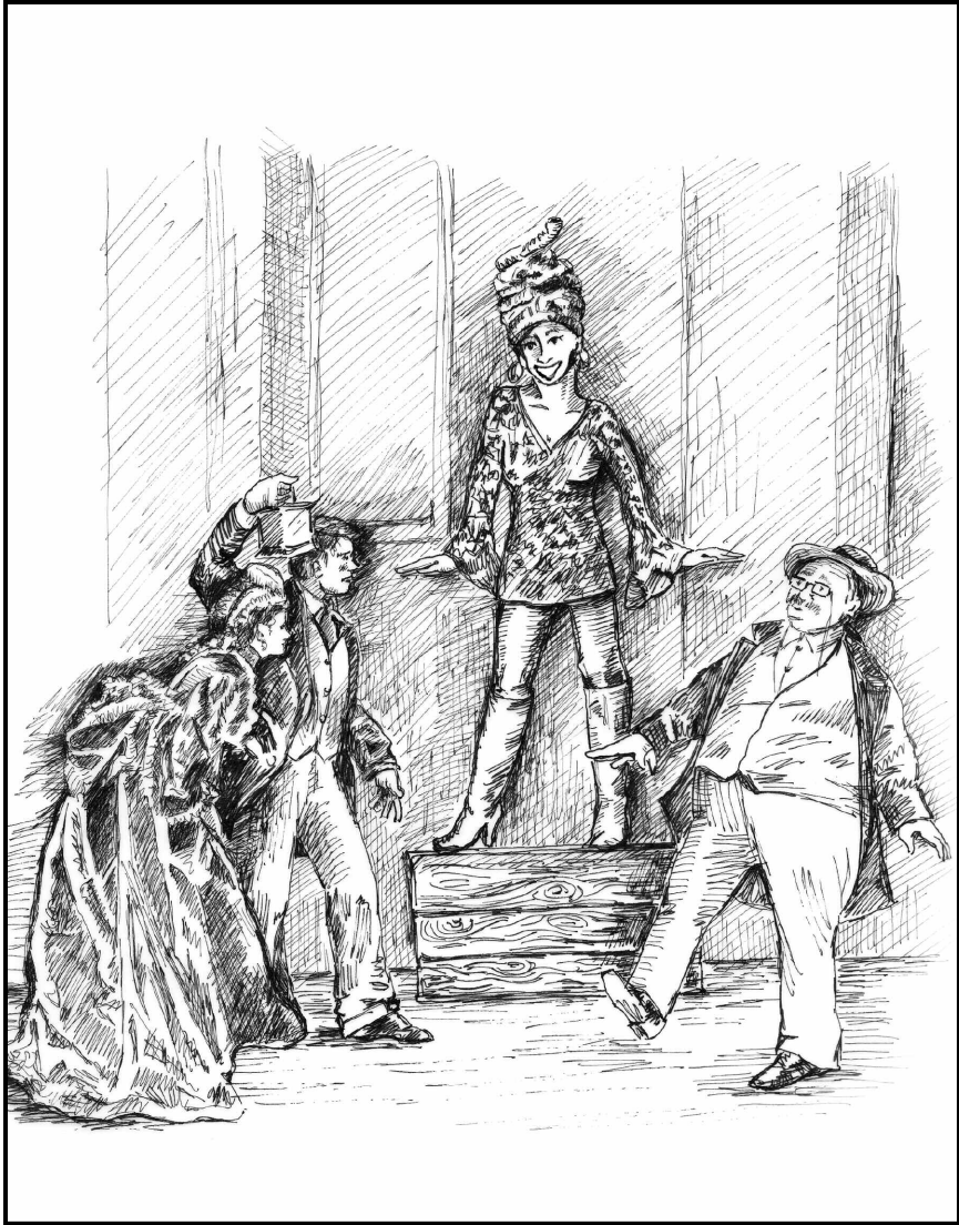
"Shark attack!" exclaimed the Mayor.