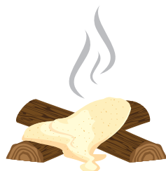
Sand or dirt

Put out the fire by cutting one of the sides of the fire triangle. You can do this by covering it with sand or dirt, dousing it with water or letting wood burn out. Make sure it's cold before you leave!