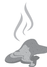
Let wood burn out